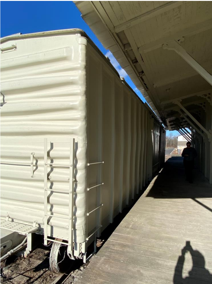
SIDE 4 50' x 11' (adjacent to the platform and train station):

This side will eventually be overlooked by a planned apartment building