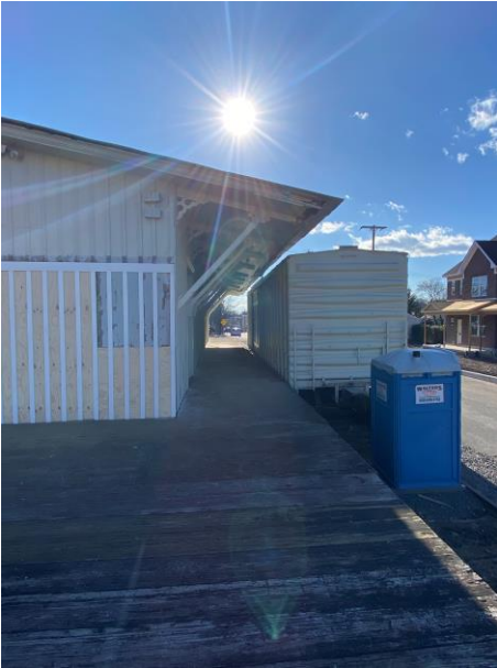
SIDE 3 10 x 11' (facing away from W. Market St):

This side will eventually be overlooked by a planned apartment building